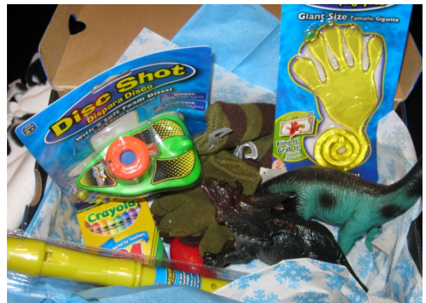
Left: Example of Shoebox Smiles and a completed fleece blanket. Above: Close-up of shoebox interior.